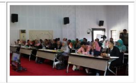
Participants of International Seminar in NAHTC Batu